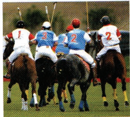
Mercedes Benz & Pantel