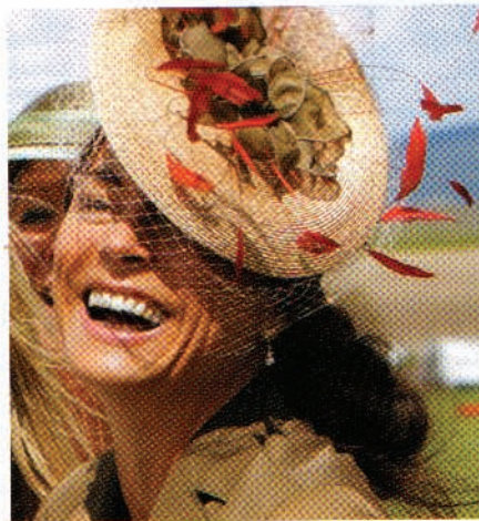
Ladies' Saturday hat competition winner